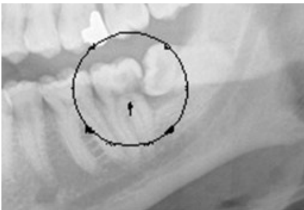
A horizontal impacted wisdom tooth. There is extensive decay in the tooth in front. Both teeth will need to be removed.

If you have a medical issue that requires you to start medicines such as immunosuppressants or medicines that affect the bone it is advisable to have an assessment of your teeth including your wisdom teeth before you start these medicines. If you were to have a tooth extracted while on these